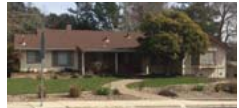
19 Corliss Drive

Compass is a real estate broker licensed by the State of California and abides by Equal Housing Opportunity laws. License Number 01866771. All material presented herein is intended for informational purposes only and is compiled from sources deemed reliable but has not been verified. Changes in price, condition, sale or withdrawal may be made without notice. No statement is made as to accuracy of any description. All measurements and square footages are approximate.