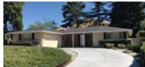
1103 Larch Avenue