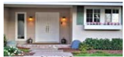
5 Lynch Court