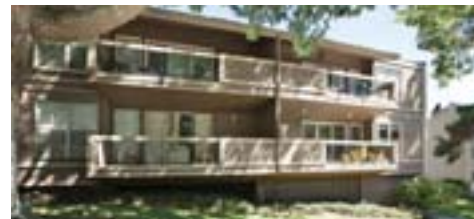
2083 Ascot Drive