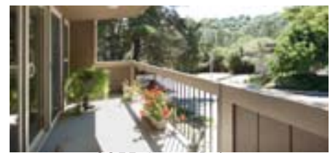
2055 Ascot Drive