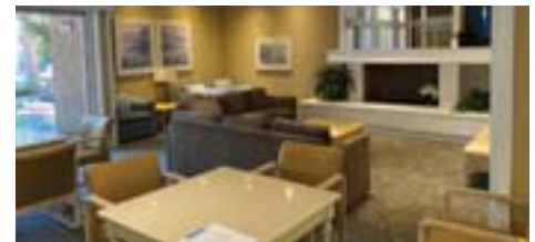
1236 Walker Avenue