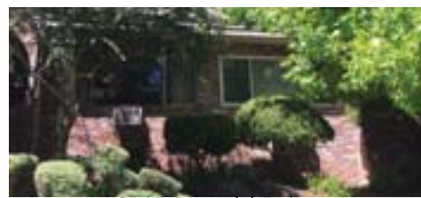
2145 Donald Drive