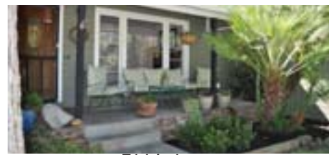
31 Iris Lane